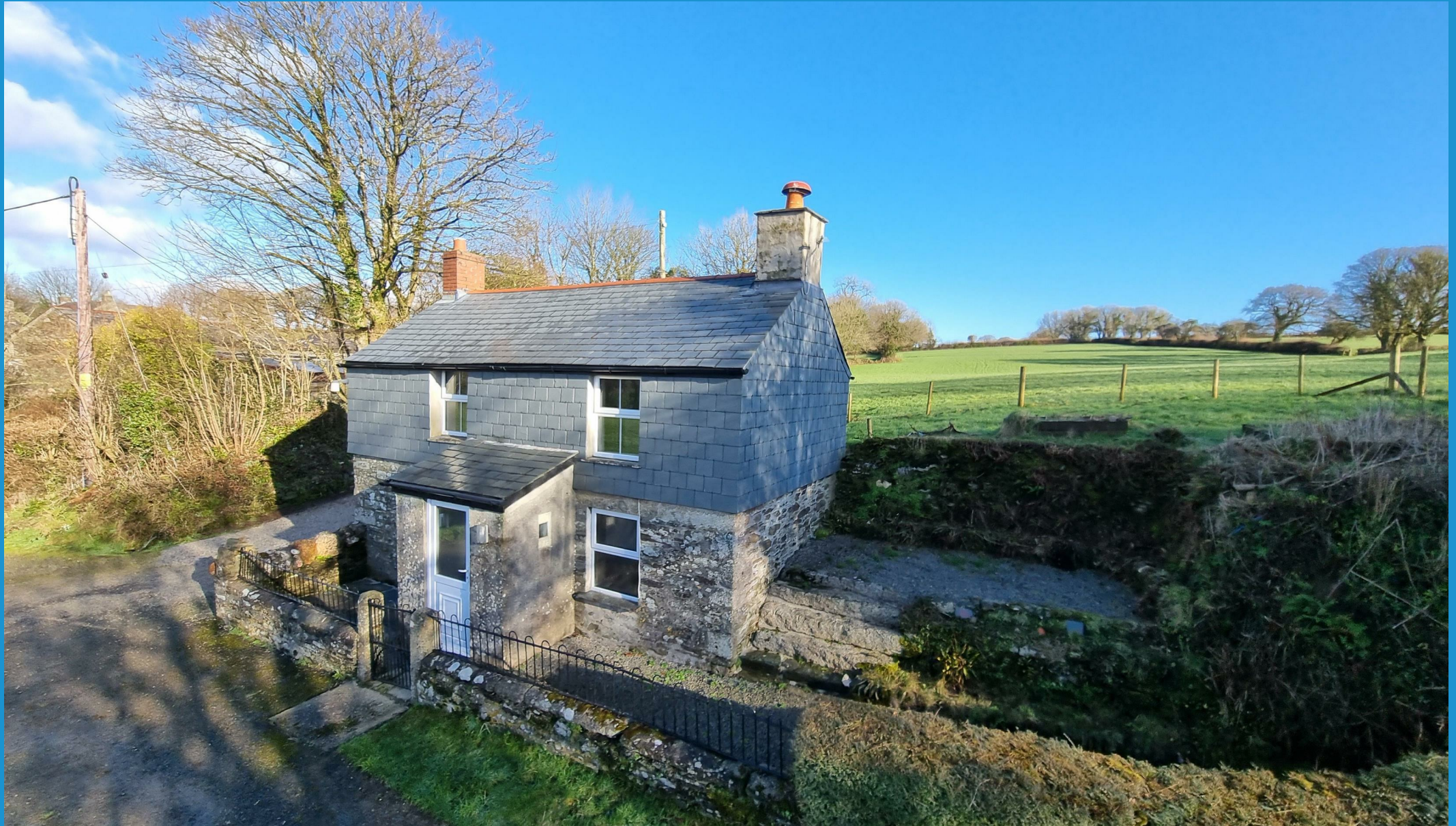
Rose Cottage Coads Green | Launceston |